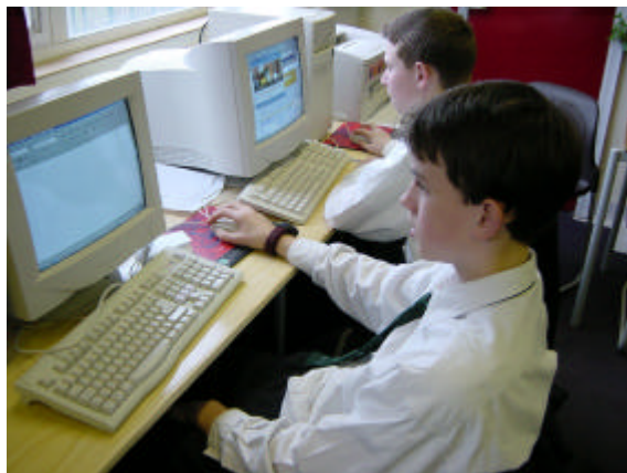
Fig x: Year 9 students at SWCHS working on their Macbeth Project.

For several years, the English department have delivered a module on Shakespeare to all students at the end of year 9. This has been focused on Macbeth and was traditionally delivered through a combination of taught content, book based resources, discussion and presentation work – mainly in written report format. With the provision of laptops to all teachers, the introduction of broadband – school wide internet access and improving networked computer facilities; it was decided to try and enhance students' experience and develop a wider range of skills by refocusing the task into an ICT led activity.