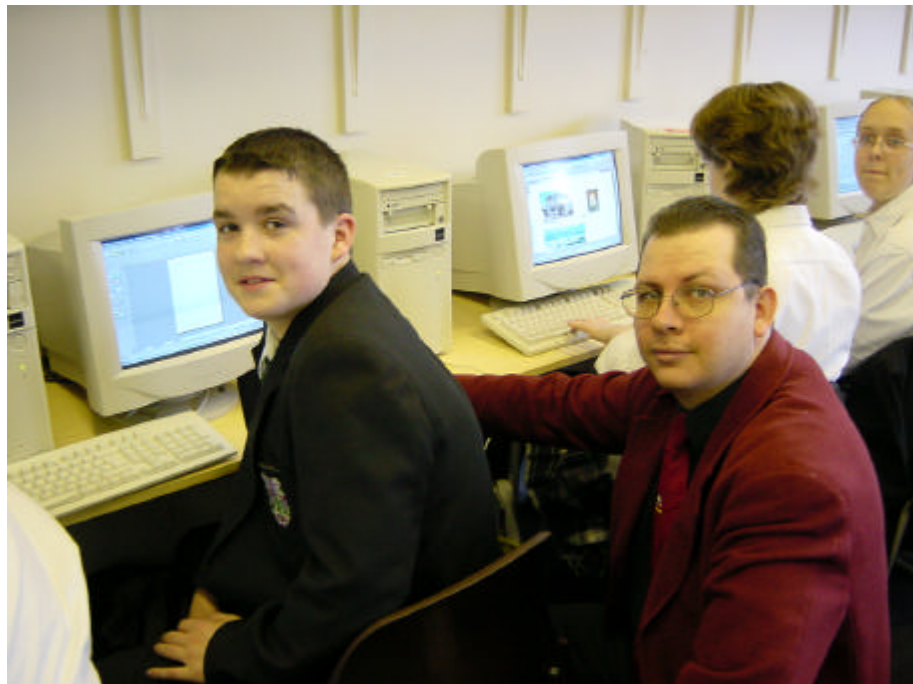
Fig y: The Author supporting a year 9 English Group

Each class was supported by an ICT 'specialist' if required, both to teach the web creation aspects of the task and to help and support the normal English teacher in guiding the group. Students were able to capture resources off the internet, scan in material from the books and record their own audio interpretations of the scenes they had chosen – if desired.