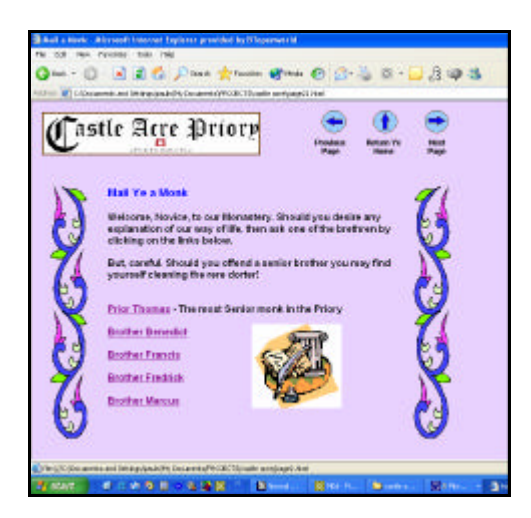
Fig 1: Castle Acre Website